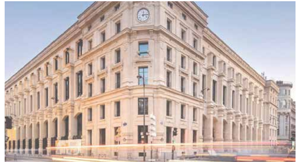
La Poste Du Louvre Paris, France.

In various international settings, our technology finds application. We can create windows and doors into various exceptional and high-end designs, such as restoration projects for historical buildings or creating luxurious architectural designs.