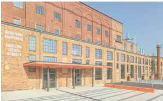
Digital Zentrum Kempen, Netherlands