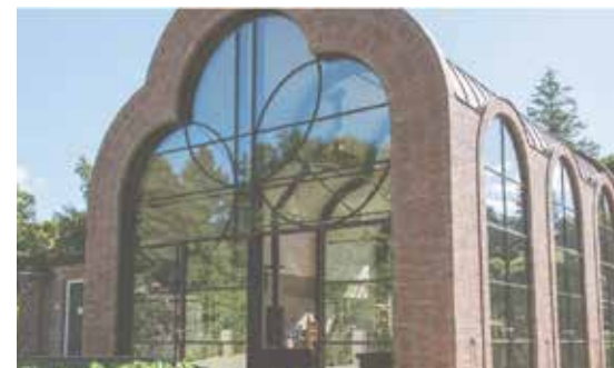
Orangerie Tuin Oosterbeek, Netherlands